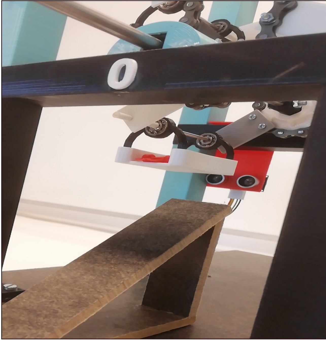
Ultrasonic distance sensor measures the distance to passing platforms.