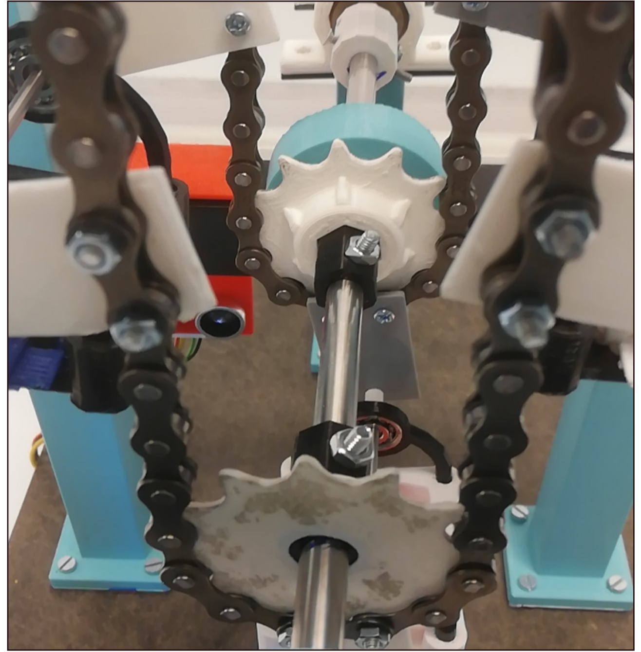
Motion transmission from the DC-motor to the rotation of the platforms.