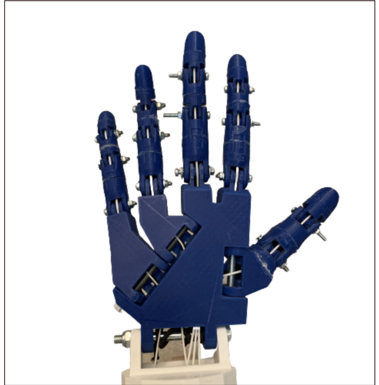
Robotic hand controlled by the glove.