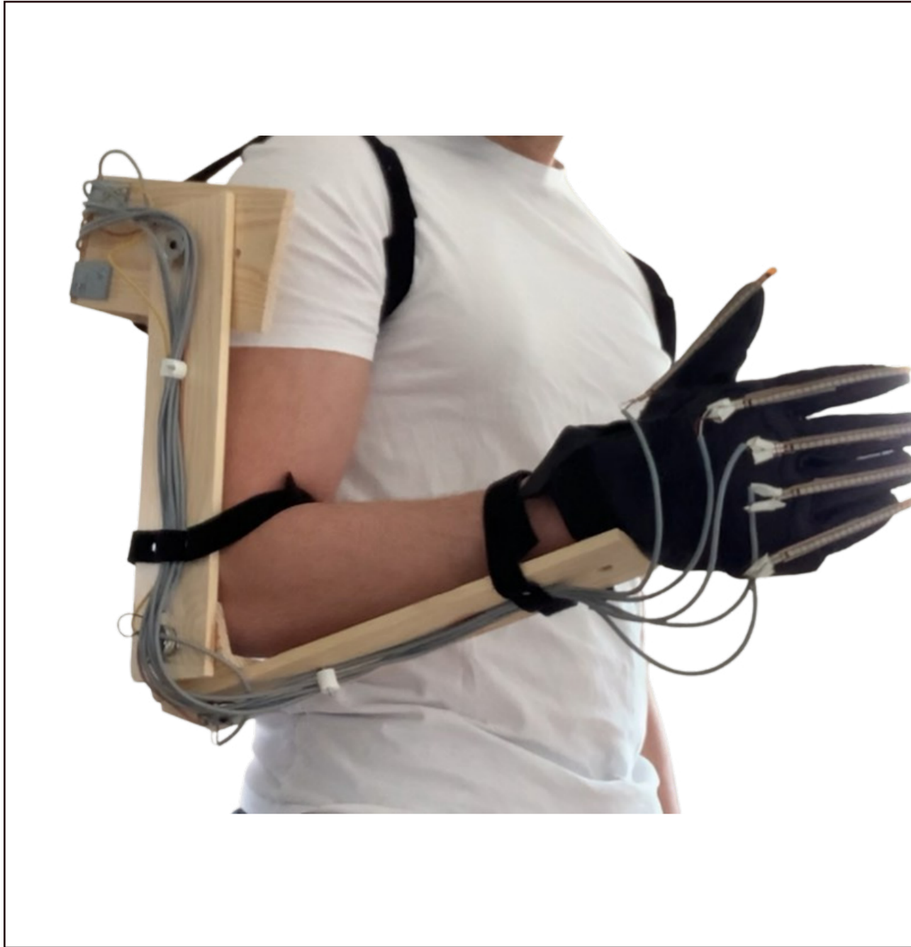
Steering mechanism that is adjusted after the user.