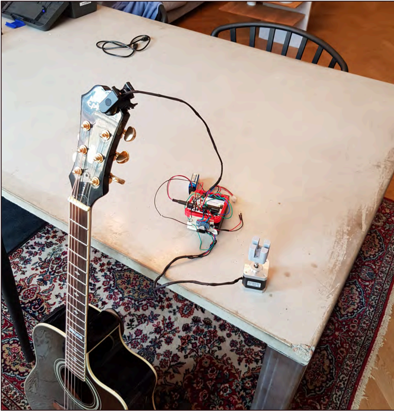
The piezoelectric element is attached to the head of the guitar.