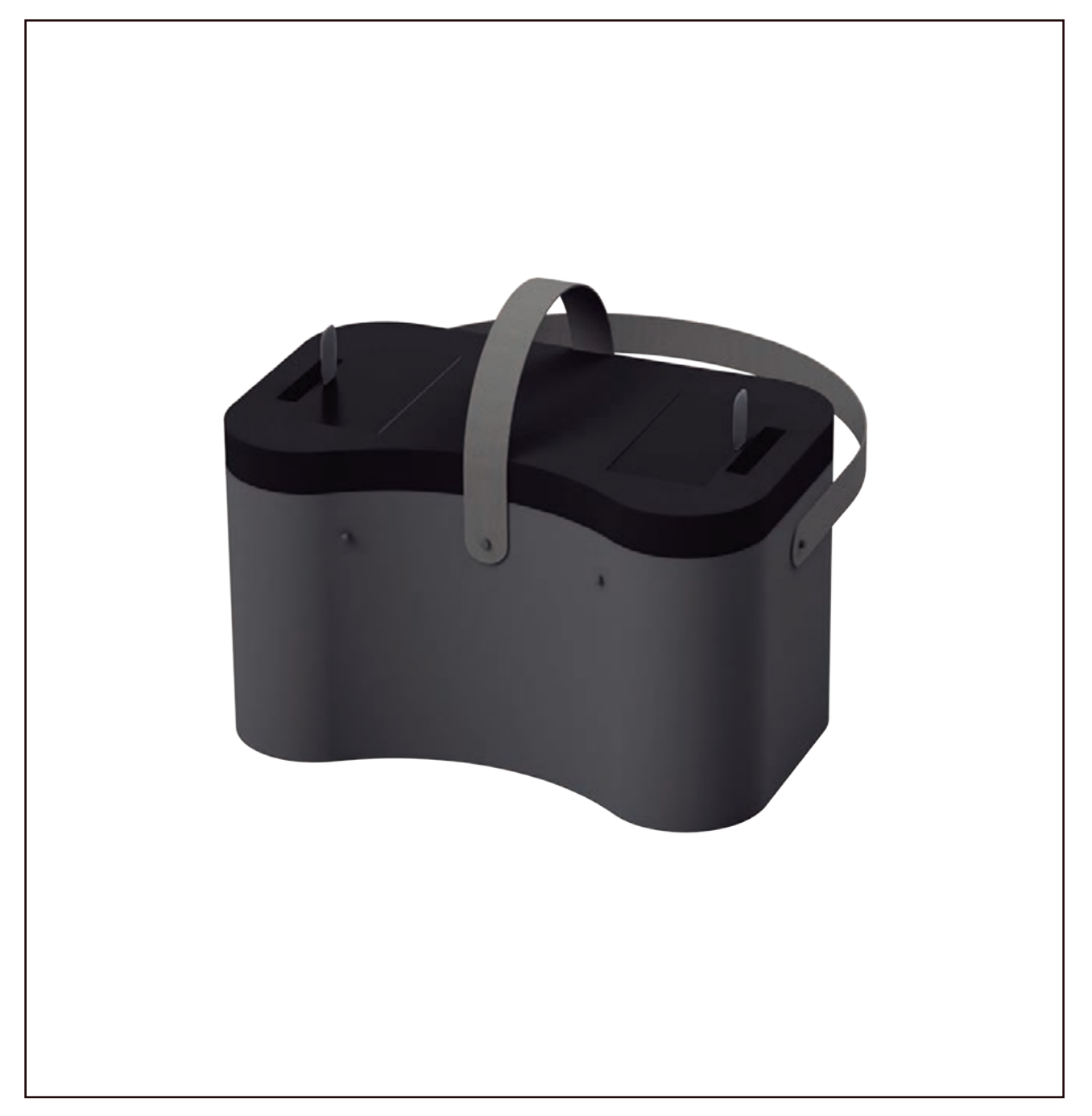
The bucket has different straps to be carried by. The mat can be placed on top for transport.