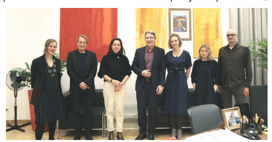
Fig. 2: Visiting Professors' Reception at Vice Rector for Academic Affairs at TU Wien, November 2019

offers urban educational assessments, comments, and scientific review activities, and consults with the faculty's dean and study deans regarding the inclusion of new teaching content in architecture and planning curricula. The team further facilitates communication and joint action between the actors at the centre and other institutions in Vienna, and beyond. At the European and international level, the team is responsible for the creation of new academic networks as well as the solidification of existing scientific ties and cooperations.