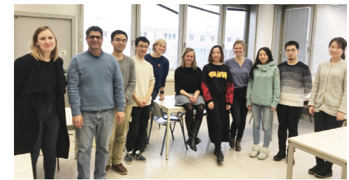
Fig. 7: Module 11, Winter Term 2018/19

were allowed to probe into the century-old nexus between migration and cities. Recent developments at the interface between migration, urban space and citizenship and the ways in which they are mutually constituted were examined, paying special attention to cities as crucial sites for conflicts over rights, recognition and belonging in post-migrational and super-diverse societies. Against this background the role of counter movements such as social non-movements, feminist housing movements, activists pursuing anti-politics