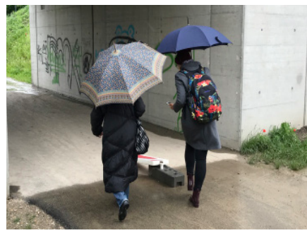
Fig. 18: Go-Along Interview, April 2019