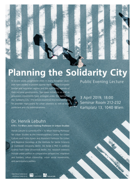
Fig. 13: Poster Public Evening Lecture 2019

For more information visit: https://skuor.tuwien.ac.at/en/veranstaltungen/vortraege.