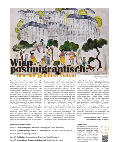
Fig. 11: Cover of the Augustin Supplement "Postmigrant Vienna"

In a series of seminars and lectures imbedded in a workshop atmosphere, students were given the opportunity to discuss cutting-edge theories and to learn about recent debates at the intersection between urban studies and migration studies. Departing from the debate about cities in postmigrational societies, the discussion was expanded to the recent literature on encounters and borders, alter politics and citizenship and difference and (super-)diversity in urban space. These debates were contextualised with wider discussions on urban precarization and growing social inequality with the aim to include socio-spatial dimensions of social closure, authoritarianism and racism.