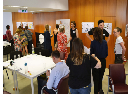
Fig. 19: Dialogue workshop, June 2019