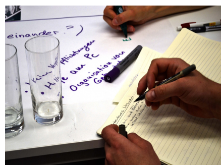
Fig. 20: Dialogue workshop, June 2019