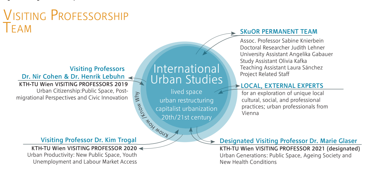
Fig. 3: Visiting Professorship Team

For more information visit: <a href="https://skuor.tuwien.ac.at/en/about">https://skuor.tuwien.ac.at/en/about</a>.