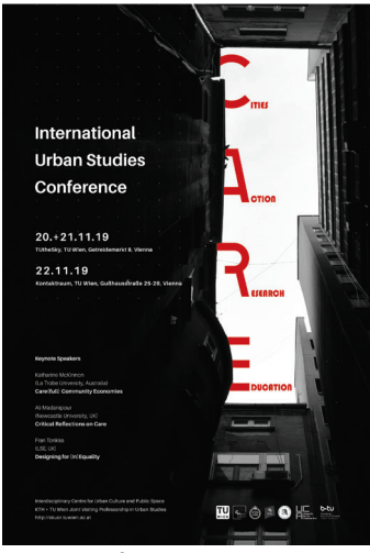
Fig. 22: Conference Poster

and dispossessive features. The concept of care allows for connecting the early modern focus on (factory) workers as the realm for urban resistance with late modern interest in the urban population as a key agent for change in order to rethink the relation between labour, habiting and care in contemporary times. Particularly neo-Marxist, feminist, poststructuralist and postcolonial approaches have engaged with the scales, dimensions and practices of care to accentuate 'other' realms of labour (no paid, low paid, underpaid) and underrated forms of political organization of resistance (non-movements, quiet encroachments, fragmented mass activism) that play out in the public and private realms of contemporary cities, as well as across their divides. Endeavours that call for an ethical engagement with urban citizens, communities and collectives trigger a care debate that challenges and enriches the focus on spatial justice and urban rights. In this context, this conference aimed to 'map', 'sketch' or 'engage with' analytical dimensions of care by emphasising everyday life as a dazzling, yet ambivalent interface for intersectional research of multiple notions of care.