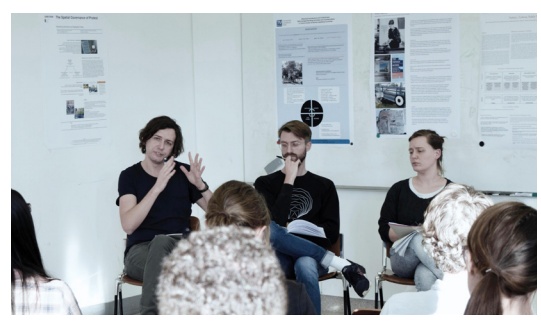
Fig. 8: Thesis Colloquium 2018

Contemporary urban theory has developed apace over the last decade to consider complex urban processes and issues that have risen as a result of globalisation, diversification of the economy, socio-demographic shifts, changing political agendas, migration and growing concerns around the environment amongst many other salient issues. The seminar was offered to doctoral students and advanced master students in urban studies and related disciplines, with the overall aim of providing an opportunity for the students to discuss their thesis projects as additional support in the development of their research theories and methods.