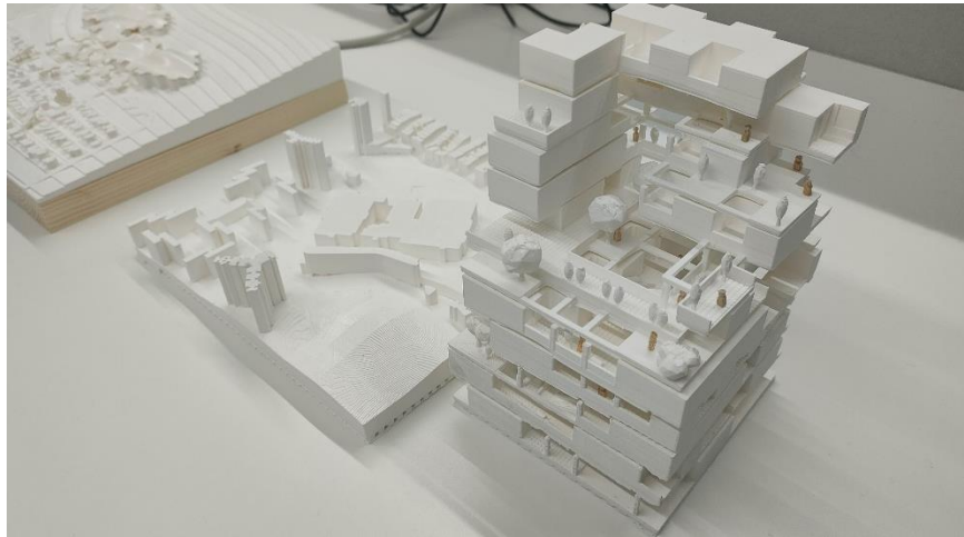
The 3D printing model of my studio

involving the application of many new technologies. For my field of study, urban planning and design, KTH is probably more towards engineering and theoretical exploration, while Aalto is more towards artistic design and expression, which is also evident from the faculty to which it belongs