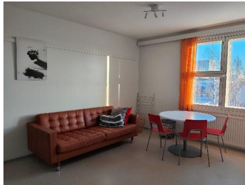
Our apartment provided by Hoas