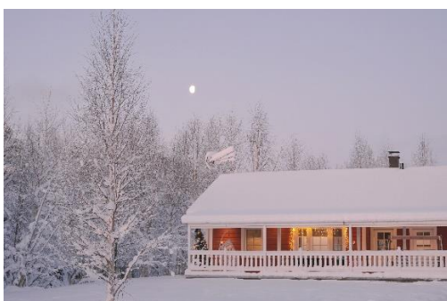
View in Rovaniemi

Finns are a bit shy and I'm not a very social person, so I didn't make many friends in Finland. Most of my new friends came from classmates in the courses I was involved in or people from the same country as me.