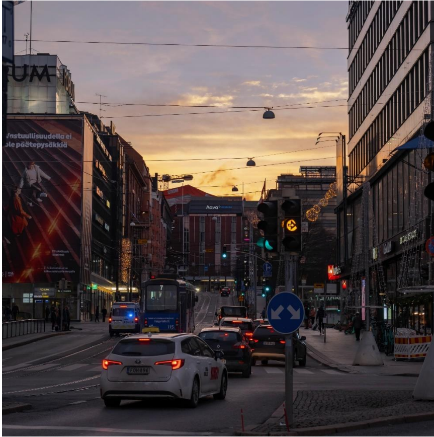
Helsinki city center

The social climate in Finland is relatively similar to that of Sweden. Finnish people are generally very friendly and helpful, and I have felt a lot of humanity and warmth during my exchange. Helsinki is not a large city, but it has a very well-developed urban infrastructure and its own distinctive cultural features and characteristics that are worth exploring. Finland's nature is also very beautiful.