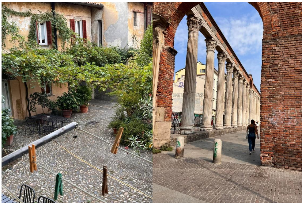
The garden outside my accommodation and Navigli area