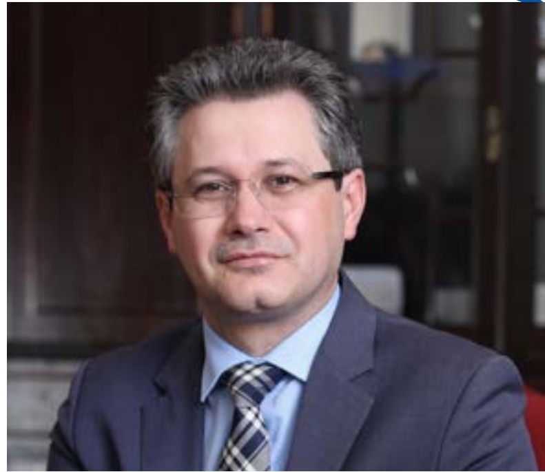
Mihnea COSTOIU RECTOR

POLITEHNICA Bucharest is a true magnet for talent, offering a dynamic, diverse, and inclusive environment where ideas and energy flow freely. Our cutting-edge research centres - CAMPUS and PRECIS - house over 70 fully equipped laboratories focused on some of the most important challenges of our time: clean energy, sustainability, artificial intelligence, robotics, and much more. We deliver solutions - this is why we are connected to over 1,000 companies worldwide .