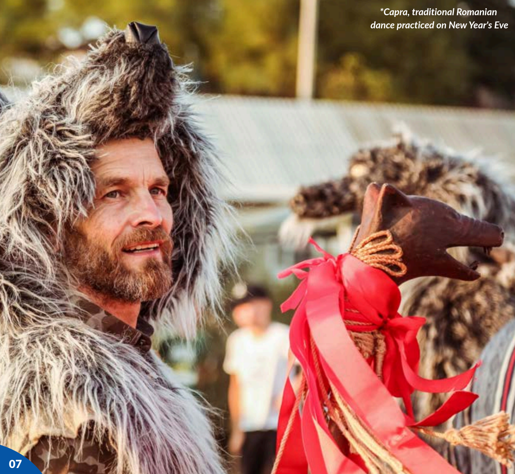
*Capra, traditional Romanian dance practiced on New Year's Eve