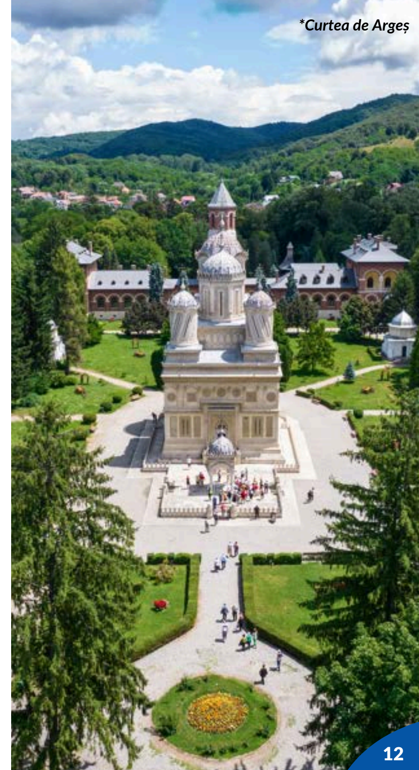
*Curtea de Argeș

Pitești is also strategically located with efficient transportation links to Bucharest, the medieval town of Sibiu, and the Carpathian Mountains , making it an ideal place for people eager to explore both the urban regions and the landscapes that Romania has to offer.