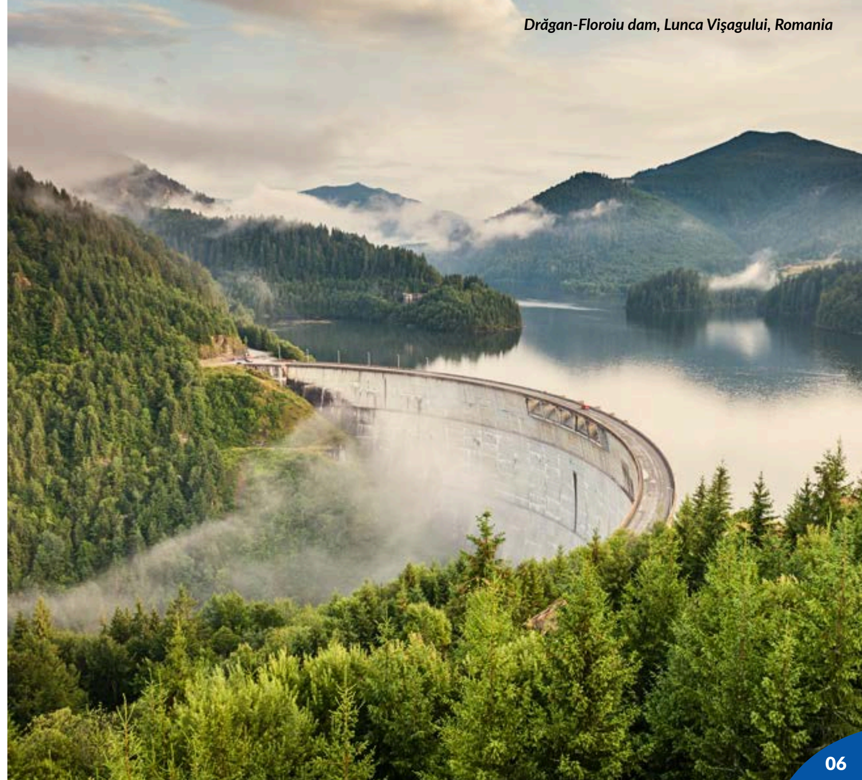
Drăgan-Florioiu dam, Lunca Vișagului, Romania

In recent years, Romania has experienced a remarkable surge in popularity as a destination, not solely as a traveling option, as many are finding it to be an ideal place to not only visit but also to live and enjoy a fulfilling life .