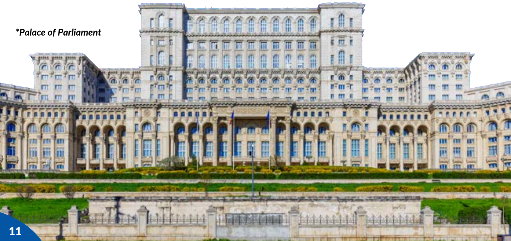
*Palace of Parliament

Though historians trace the actual founding of Bucharest to the 14th century and link it to Voivode Vlad Țepeș (Vlad the Impaler), the tale of Bucur remains deeply rooted in the city's cultural memory and is still told as a poetic origin story. A small church known as Biserica lui Bucur (Bucur's Church) , located near the Parliament building, keeps the legend alive.