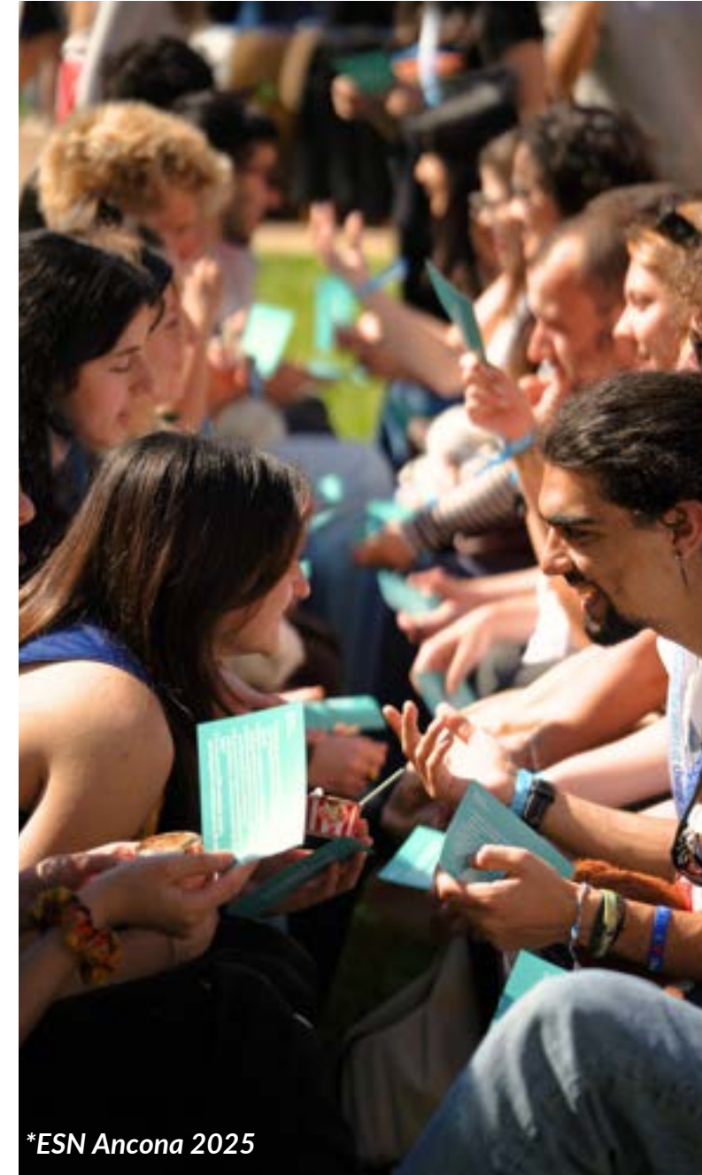
*ESN Ancona 2025

The European Project Semester (EPS) is an innovative academic programme offered by several universities across Europe, including POLITEHNICA Bucharest . It is designed for students who have completed at least two years of undergraduate studies, primarily in engineering fields . However, it also welcomes students from other academic backgrounds, provided they are prepared to contribute to an interdisciplinary engineering project.