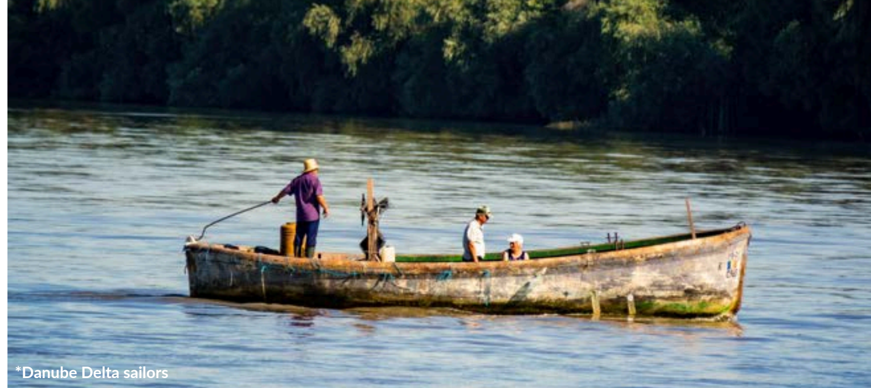
*Danube Delta sailors

In the village of Săpânța, Maramureș, lies the Merry Cemetery, a truly unique graveyard where each wooden cross is painted in vivid colors and features a poetic, sometimes humorous epitaph. Created by local artist Stan Ioan Pătraș in the 1930s, the cemetery reflects a philosophy that embraces death with honesty, irony, and even a smile.