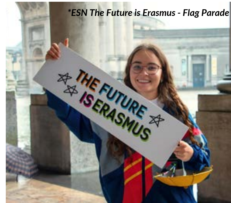
*ESN The Future is Erasmus - Flag Parade

Incoming students should be aware of the general academic calendar at POLITEHNICA Bucharest. The first semester (autumn) typically begins in early October and ends in late February , including a 14-week teaching period , a winter holiday break , and an examination session . The second semester (spring) generally starts in late February or early March and runs until late June or early July , including a dedicated exam session . Application deadlines for Erasmus+ mobility are generally set for mid-June for the first semester and mid-November for the second semester , but students are advised to confirm the dates with the Erasmus+ Office . Each semester also includes one or more short breaks and follows a structure that allows students to balance academic workload and cultural exploration during their stay.