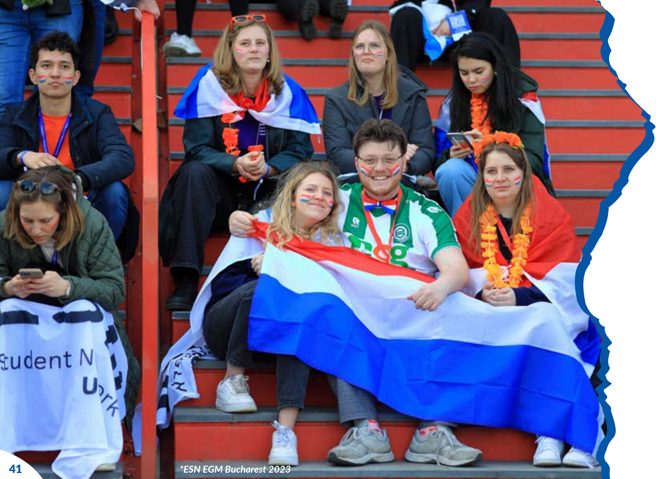
*ESN EGM Bucharest 2023

With just one quick scan, you can access all our external resources and the complete digital book. This instant access keeps all essential information, partner links, and detailed materials right at your fingertips