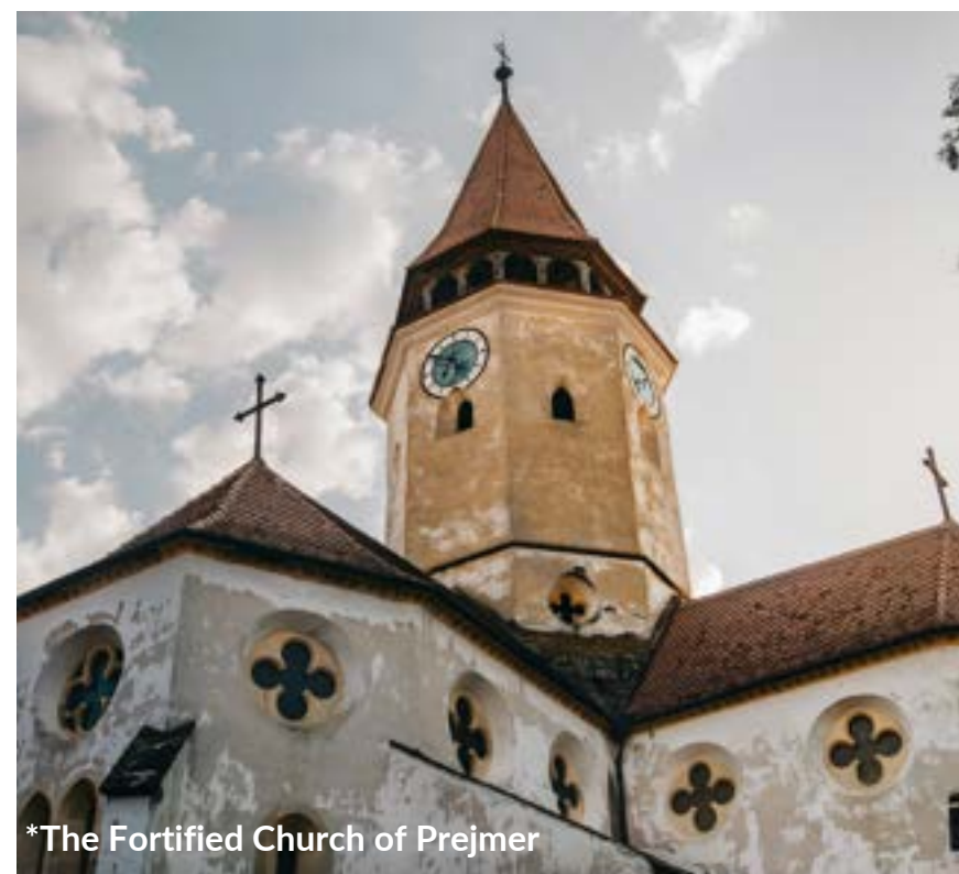
*The Fortified Church of Prejmer