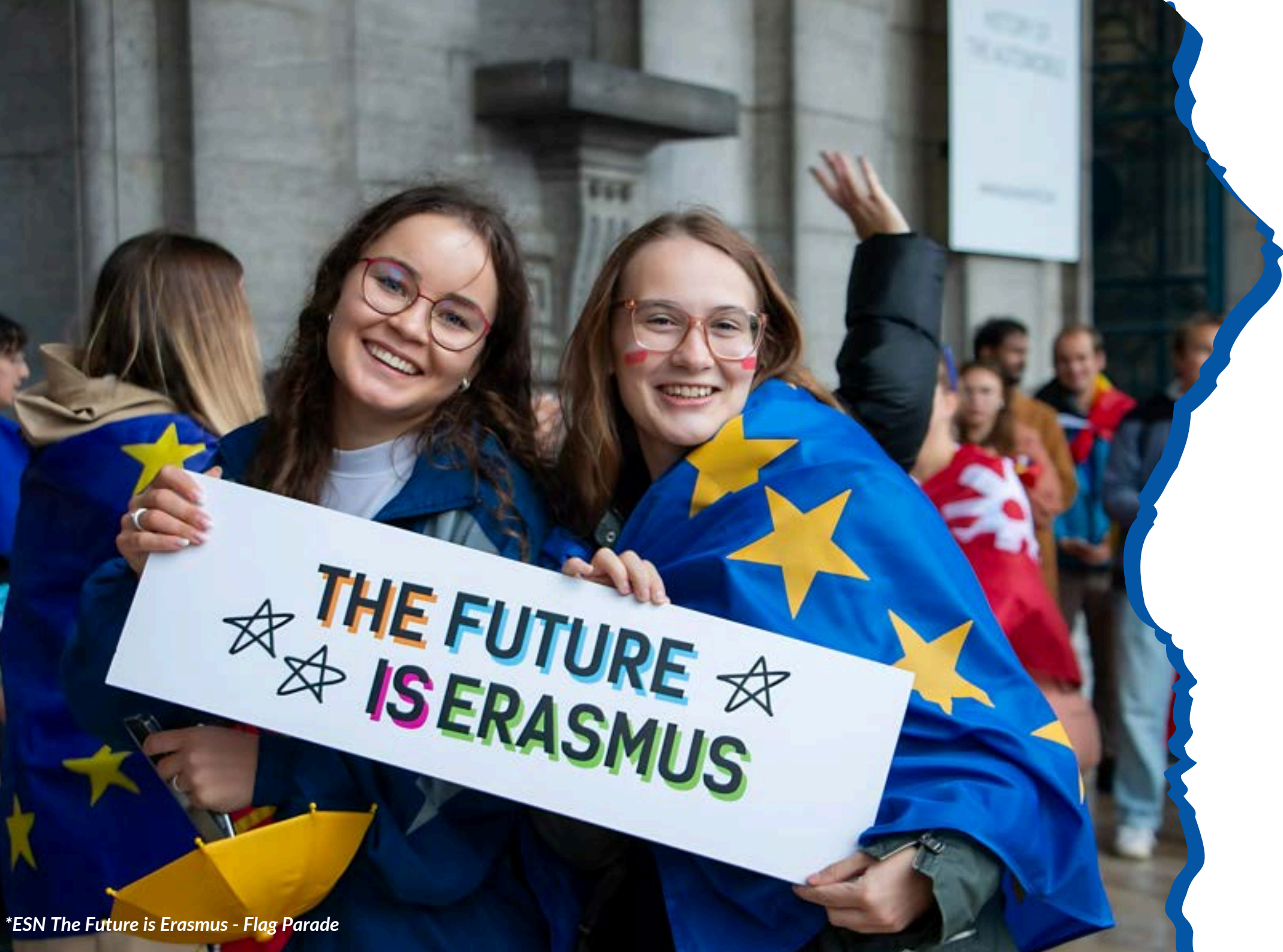
*ESN The Future is Erasmus - Flag Parade