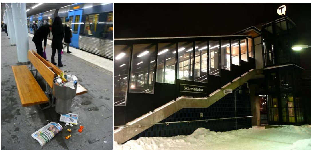
Figure 3 – Examples of (a) littering at an underground station and (b) dark, hidden places at underground stations.