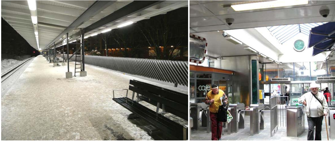
Figure 4 – Examples of (a) a light clean underground station and (b) CCTV installed at the entrance of an underground station.