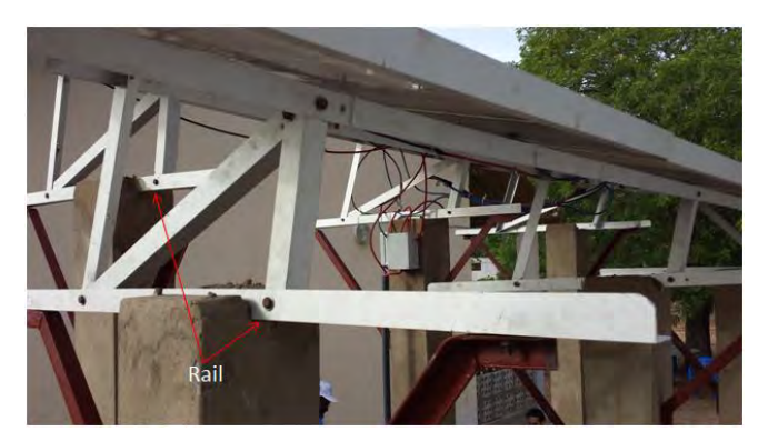
Figure 8 : Fixation to the pillars

The first step was to lift the metal structure to the top of the pillars. It was necessary to use a scaffolder in order to work in a more comfortable way above the ground. To secure the structure on the concrete pillars basically two techniques were used. The first one is to make a rail at the top of each pillar to place the metal structure and limit its movements. A bolt was used to fix it on the rails of the pillars. The array was fixed at its gravity center point and not at the middle of the leg (since the structure was inclined). The second technique consisted on steel profile segments located in the angle between the PV structure and each pillar. Each segment was bended and welded in order to get the desired shape. This would help to keep the balance of the whole array. Once the structure was secure on top of the pillars, very carefully, one by one each PV panel was lifted and fixed with four bolts over the structure.