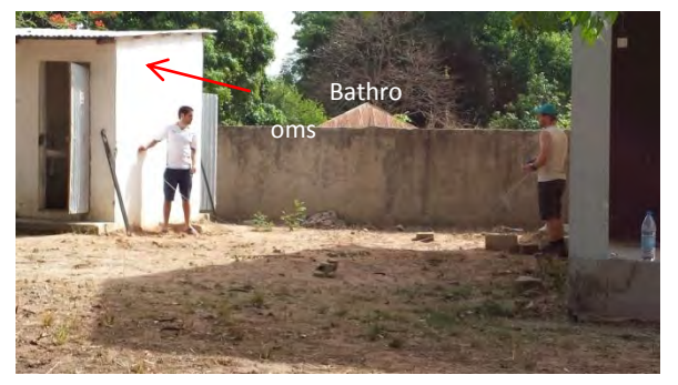
Figure 6: System location before installation

This problem was solved with six concrete pillars to place the PV structure. Generation non – Violente had the possibility to make this fast and economically viable.