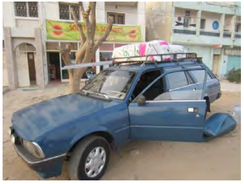
Figure 5 : Equipment ready for the trip

Bringing the equipment was the first step of the field work, and not the easiest one. One morning, we had to fit in a 7-seats car and on its roof: 8 batteries (250kg in total), 8 solar panels (more than 100kg), cables, controller and inverter, some gifts we had to bring for a festival organized in one of the towns before Brin and 5 people whose the representant of the minister of youth.