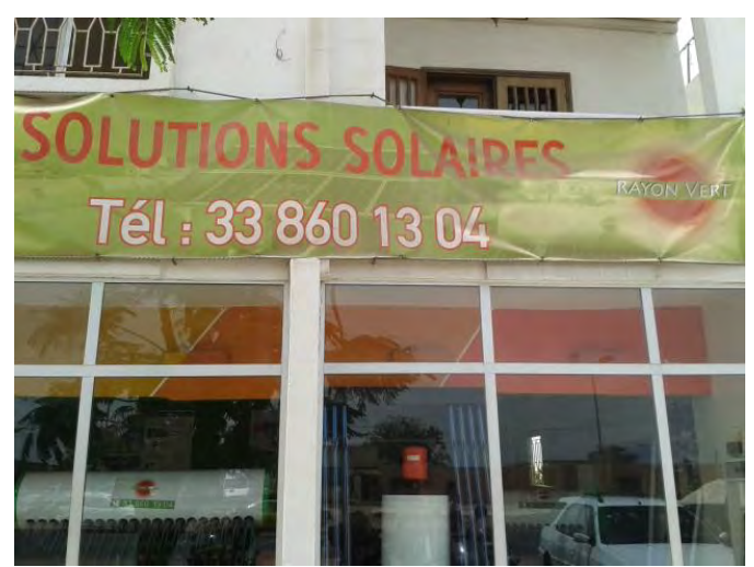
Figure 3 : Supplier company in Dakar

Rayon Vert offered a good price/quality ratio and was very accessible for each query <sup>[6]</sup>. After having determined the right design several offers were made by the company. A special attention was put on buying components that would be easily exchangeable. That is why the idea of bringing the components to Senegal from Europe by ourselves was rejected. The main advantage of Rayon Vert was that they used modules that were manufactured in Senegal with high quality Bosch-cells. Therefore they would be easy to replace in case of failure and in the same time would develop the local economy.