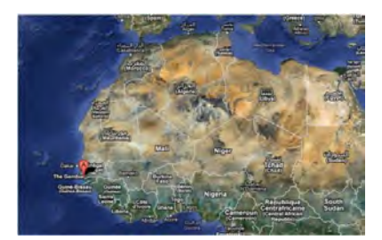
Figure 1 : Senegal location

Sub-Saharan Africa has the greatest number of people without access to electricity. More specifically, the number of people that experience that basic need are 465 million in rural areas and 120 million in urban areas<sup>[1]</sup>. In the same time, the high rates of development in Africa result in increased energy needs.