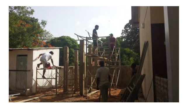
Figure 7: System location during installation