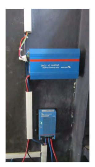
Figure 10 : Inverter and charge controller

Grounding already existed but was quite old, corroded, outside the building and not maintained. Therefore, a new grounding was installed and the 2 groundings were linked. This assures that the panels, the loads (and people using it) will be protected.