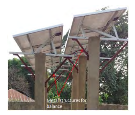
Figure 9 : Structure reinforcement