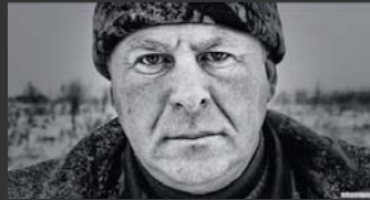
Unravel / Metamorphosen