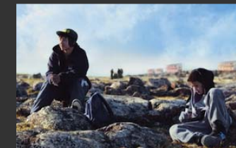
Jorinda/A Cherry on Top / Uvanga