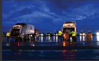
Plastic Bag / Trash Dance