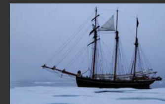
Raindeer / Expedition to the End of the World