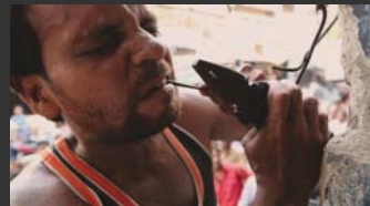
Sweet Crude Man Camp / Powerless