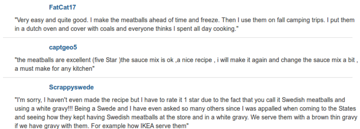
Figure 1: User comments to a recipe.

Users shall be able to write comments to recipes. Comments shall be stored permanently on the server, for example in a file. This means the comments shall not disappear if the server is restarted. Not only the comments shall be stored, but also information about who wrote the comment. The author's nickname shall be displayed together with the comment, for example as in Figure 1.