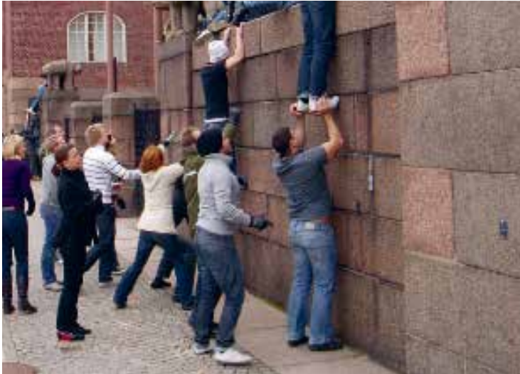
Team-building and ice-breaking activity in Integrated product development. The student teams are asked to make sure the whole team gets from one side of the wall to the other, by climbing over it. No student can climb the wall on his/her own. By this, the teachers are aiming at helping the students to start trusting and helping each other.

signs for storms, or upcoming storms. Drops are when productivity or quality goes down. Plops are when you notice deadly silence in response to someone's ideas. This can cut off creativity from the group; reasons for it could include some students just wanting to get on with the work, or not all students feeling they belong to the team. When students have hurt feelings or frustration over, for instance, the project task, the team, or their own role in the team, you might experience a pinch here and there. Pinches can be formulated in sarcastic sentences, or shown with body language. When you as a coach notice a pinch, it's best to mention it. Otherwise it can blow up to a crunch where students leave a team, refuse to solve the task and so on. (26)