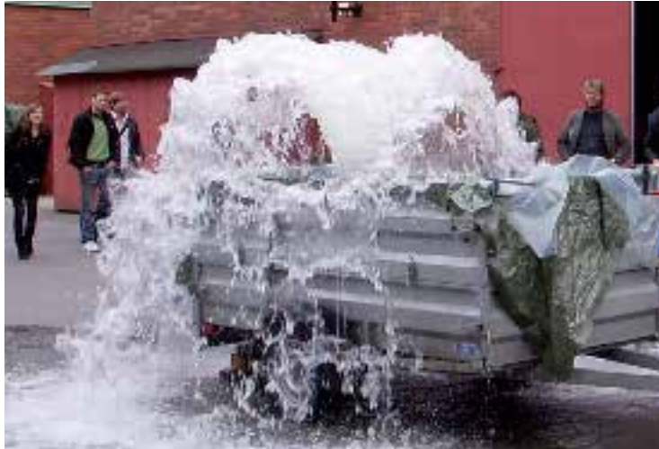
Flood pump (120 litres/s) developed by students, Integrated Product Development.

The pumps must also be able to be moved into place very quickly when they are needed. Therefore they must be available already before the flooding occurs, perhaps placed in a store cupboard or shed. They must also be sufficiently small to be able to be carried to and lowered into a drain. Finally the pump must have the capacity to pump very dirty water at high speed without breaking down.