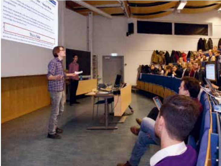
Students performing their final presentation, Future of Media.

when talking in front of different target groups. These aspects can also be a basis for the feedback and assessment criteria within your course.