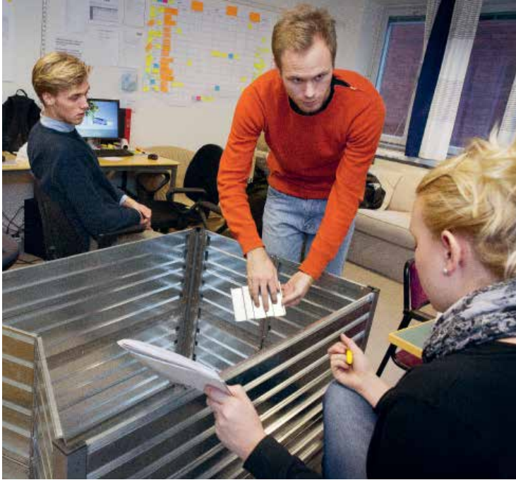
Students working on their prototype, Integrated Product Development.

ing supports idea generation, conceptualisation, design exploration, evaluation, communication, and construction. Because it can be an overwhelming undertaking to create a single prototype that strives to achieve all of these goals, it is important to be focused on the objectives. From an educational viewpoint, achieving learning objectives overshadows the importance of technical performance, even though they tend to go hand in hand.” (32)