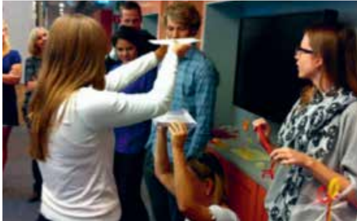
One of the groups pitching their solution in the exercise Rapid Prototyping, OpenLab.