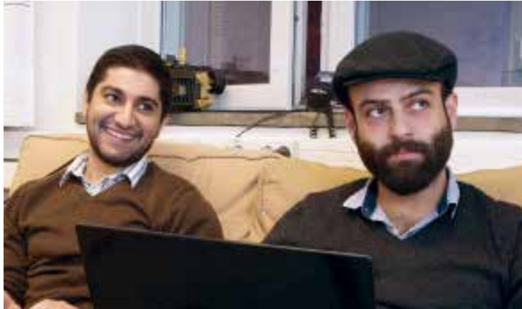
Students working in their team, Integrated Product Development.

to create an effective team. To make the team as effective as possible, all roles should be taken. However, one team member can have more than one role and an effective team should have at least four or five members. (24)