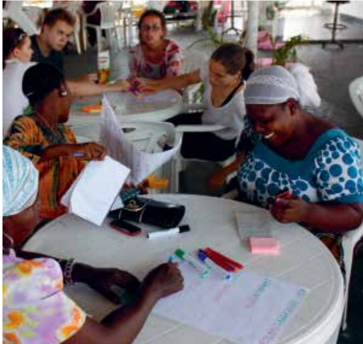
A group working on a sanitation project in Keko Manchungwa together with students from Aalto University.

with the community group to find solutions, coming up with a theme for a dry toilet as the basis for a sanitation business.