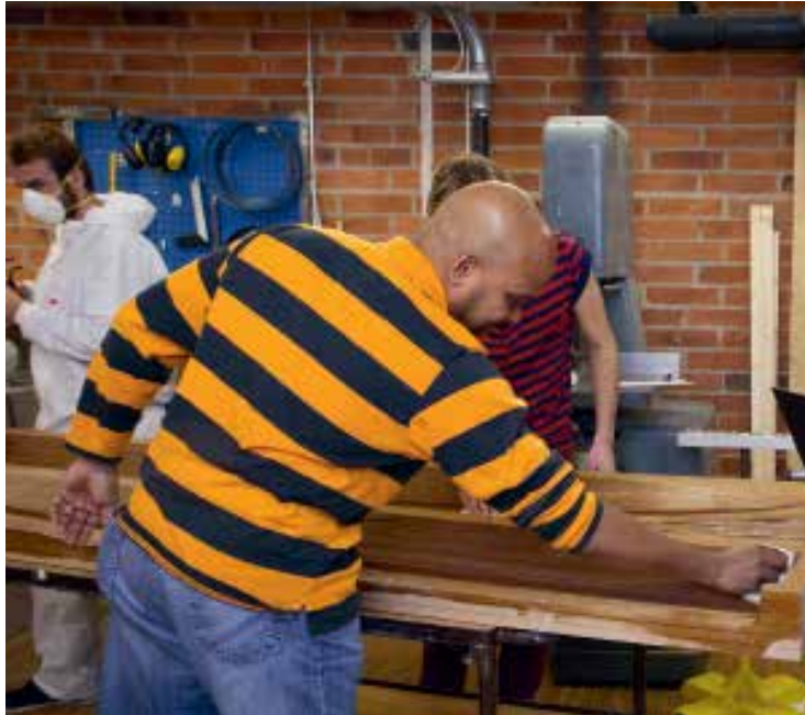
Students working on developing the solar powered boat.

Japanese students and for finding a sponsor to finance their journey to Japan in August.