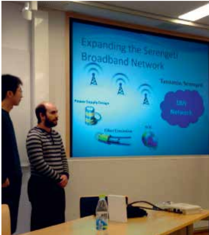
Midterm workshop with peer feedback in Communication Systems Design.

Points raised are the project plan, work packages, division of labour in the group, time commitment, technical documents etc. To be able to give fruitful feedback, they have, in addition to reading all the documentation, also interviewed members of the other team. Further to this there are teachers from the department attending the midterm workshop and they also have the opportunity to give feedback to the project teams.