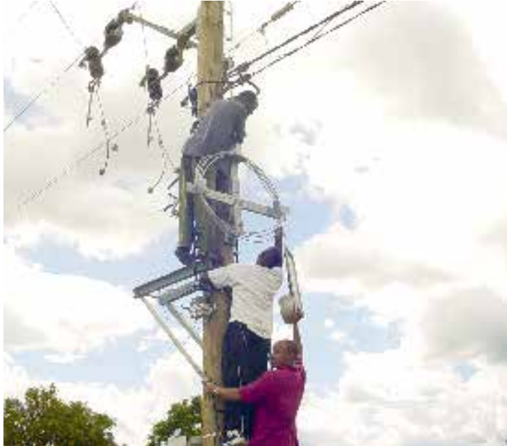
Installation of solar-powered router in Tanzania, Photo: Björn Pehrson

been the muscle that has delivered the project. Working on the projects has developed the students to a remarkable degree. They often report that course was the one where they really learned something of value, for example that it pays to work together and how to put this into practice.