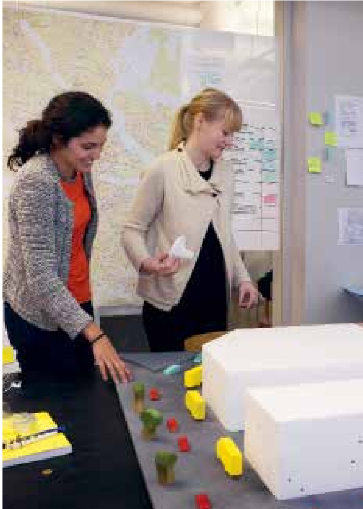
Students working on solving the problem with traffic and congestion, OpenLab.

Suggestion: There is a variation in the courses described regarding whether they have ill-defined and open ended real-world problems or clearly defined assignments for the students to work on and whether the projects are formulated by teachers or by external partners or industry. Prior to deciding upon the challenge/project task, start with