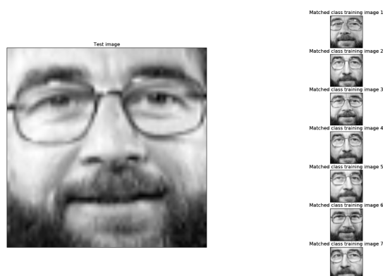
FIGURE 4. Example of visualizeOlivettiVectors output.

Note that this part is completely voluntary!