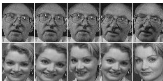
FIGURE 3. A few example images from the Olivetti faces dataset.

1.3. (Voluntary) Olivetti Faces. This dataset contains 400 different images of the faces of 40 different persons, each person is represented by 10 images. The images were taken at different times with varying lighting and facial expressions against a dark homogeneous background. They are all grayscale, and 64x64 pixels. Our task is to classify instances as belonging to one of the people.