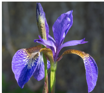
FIGURE 1. Example of Iris flower, by David Iliff. License: CC-BY-SA 3.0.

0.2.1. Iris . This dataset contains 150 instances of 3 different types of iris plants. The feature consists of 2 attributes describing the characteristics of the Iris. Our task is to classify instances as belonging to one of the types of Irises.