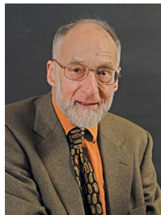
Robin Milner (1934 - 2010)