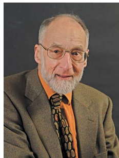
Robin Milner (1934 - 2010)