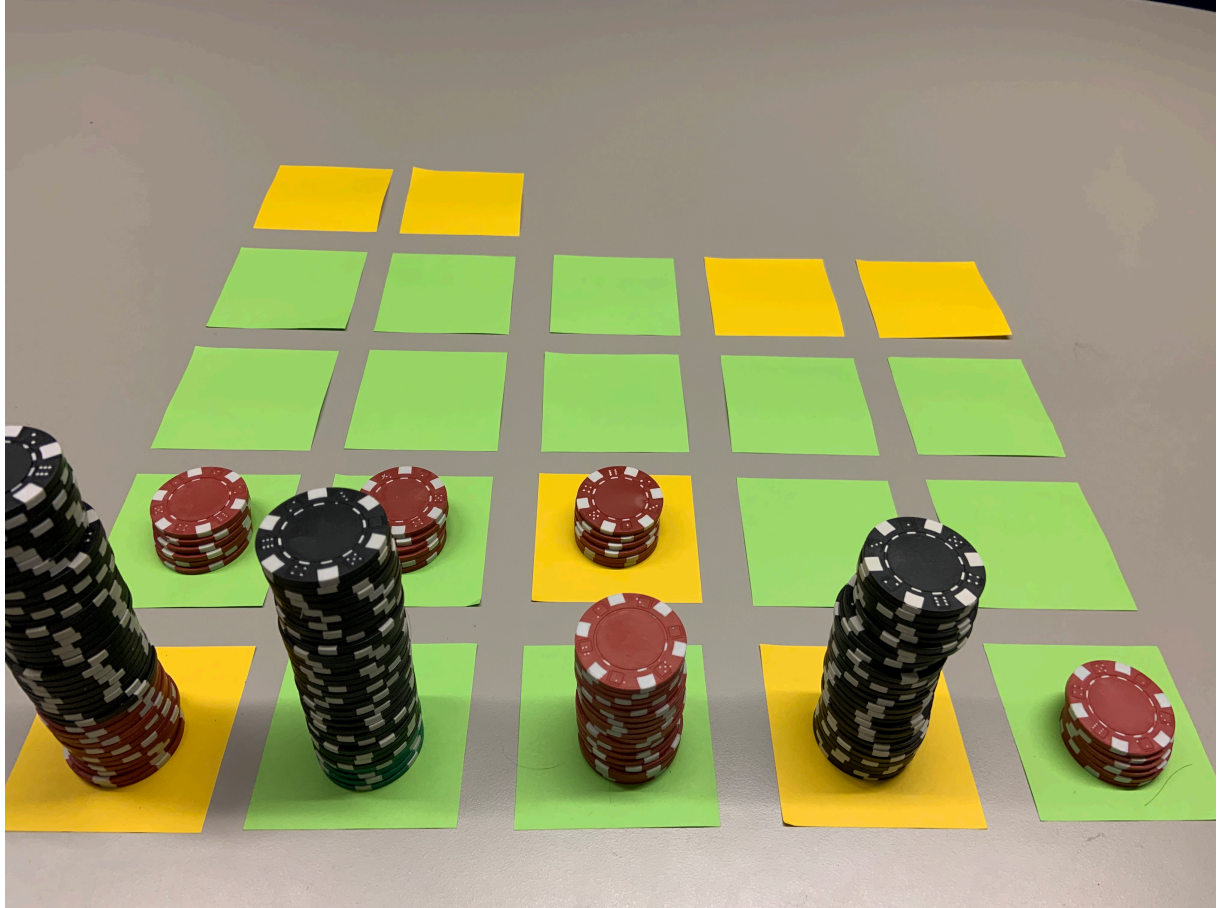
ITM MOD: House of science CO2 emissions Green = senior faculty, yellow = junior faculty