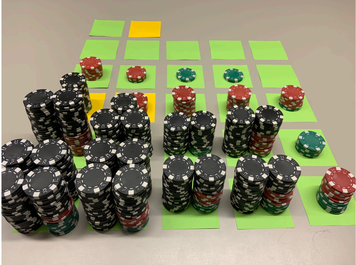
ITM MOB: Learning in STEM 2019 TRIPS. Green = senior faculty, yellow = junior faculty