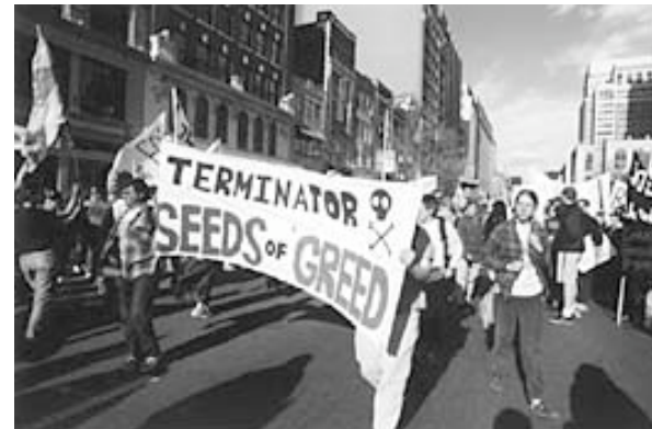
The GMO-controversy, USA