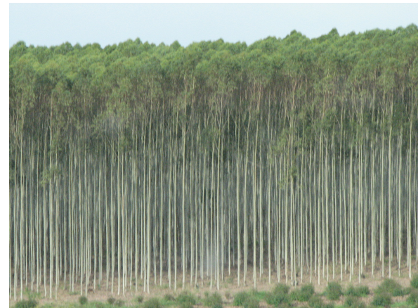
Eucalyptus plantation, South Africa