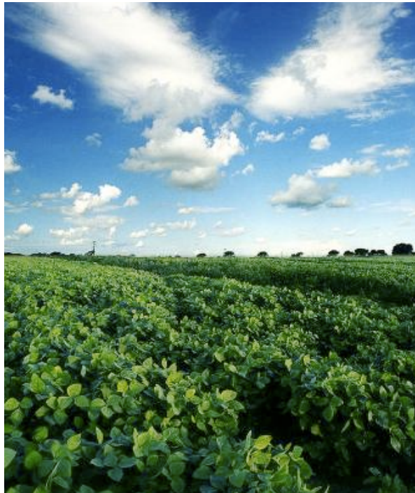
GM soya, Pampas

We discuss advances and potentials, but also the criticism and controversy. Who is using plant biotech, for what, and what is all the fuss about?