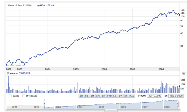
Monsanto stock (before black Monday 2008)