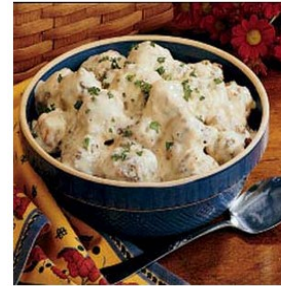
Swedish Meatballs Recipe

Prep: 30 min. Bake: 1 hour Yield: 8-10 Servings